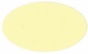
BUTTERSILK UC106670/5MY86944 PD300000